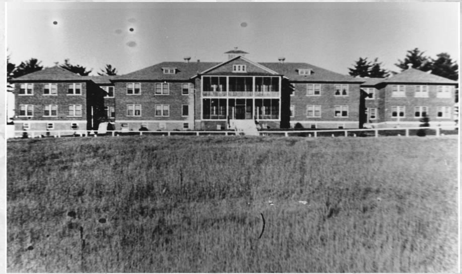
Above (left & right): both photos courtesy of Menominee Historic Preservation