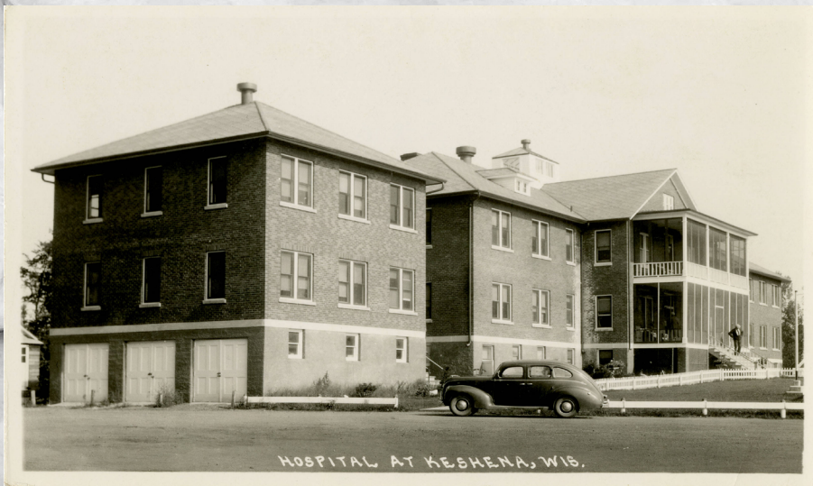
To the left: